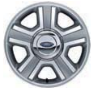
17" Machined-Aluminum Wheel with Painted Accents (XLT - available)