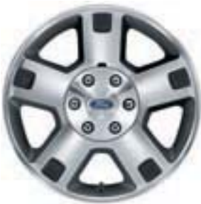
18" Machined Cast-Aluminum Wheel (FX4)