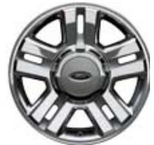
18" Chrome-Aluminum Wheel (Standard with Lariat and XLT Chrome Packages)