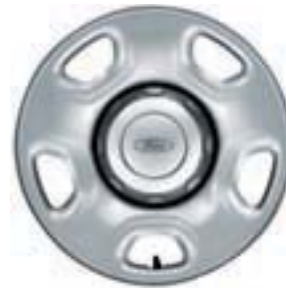
17" 7-Lug Grey Steel Wheel (Heavy Duty Payload Package)