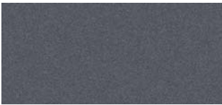
Dark Shadow Grey Metallic