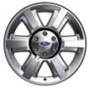
20" 6-Spoke Machined-Aluminum Wheel (FX4, Lariat, King Ranch- available)