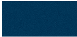
True Blue Metallic