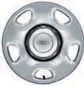
17" Grey Styled-Steel Wheel (XL)