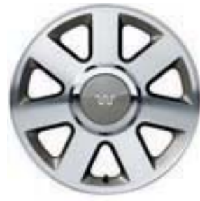
18" 7-Spoke Cast-Aluminum Wheel (King Ranch)