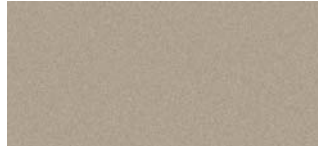
Arizona Beige Metallic