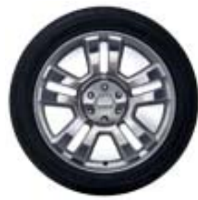
22" Polished Forged-Aluminum Wheel (Harley Davidson™ Package)