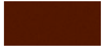
Dark Copper Metallic**