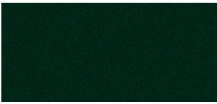
Aspen Green Metallic