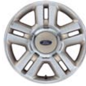
18" Bright Aluminum Wheel (Lariat)