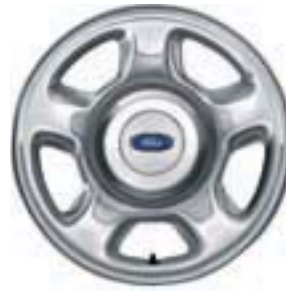
17" Chrome-Clad Steel Wheel (XLT- standard, STX-available)