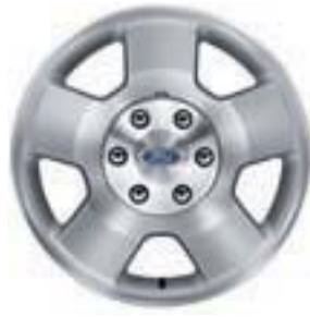
17" Machined-Aluminum Wheel (STX)